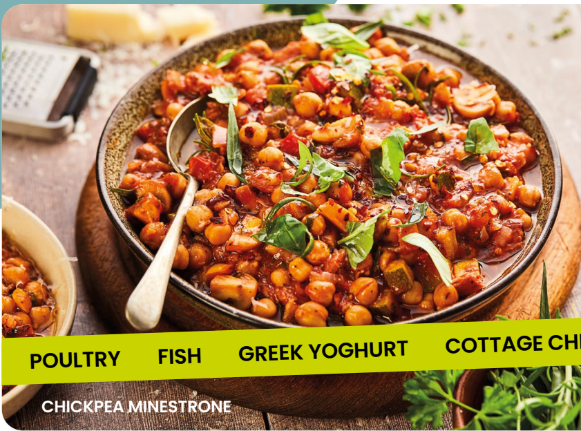
Country Range Chick Peas