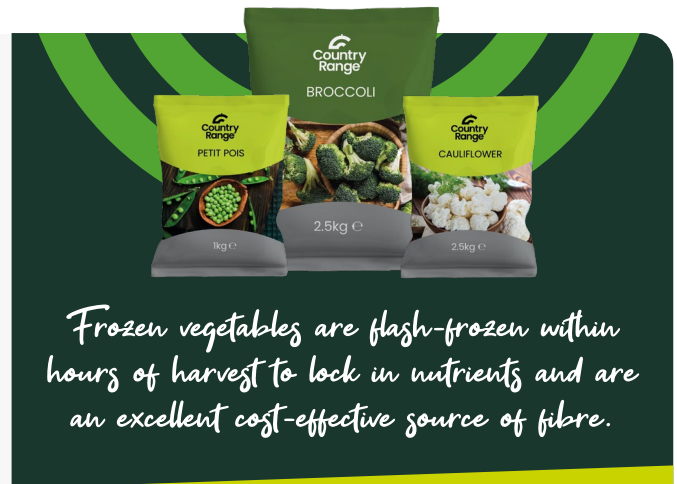
Frozen vegetables are flash-frozen within hours of harvest to lock in nutrients and are an excellent cost-effective source of fibre.

Fibre is highly important for GLP-1 users as constipation and digestive slowdown are among the most commonly reported side effects of the medication. Aside from this, there is an overall focus on increasing fibre intake, with up to 96% of UK adults reportedly failing to meet fibre recommendations 1 . Its benefits include aiding fullness, digestion, and blood sugar control. Aim for a variety of colours to provide essential vitamins, minerals and visual appeal.