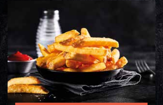
SIGNATURE BY COUNTRY RANGE DOUBLE CRUNCH FRIES SKIN ON 10 MM

The double crunch coating on our Signature by Country Range fries helps them to keep their crunch for up to 40 minutes, making them perfect for foodservice. Turn the page to see the full range.