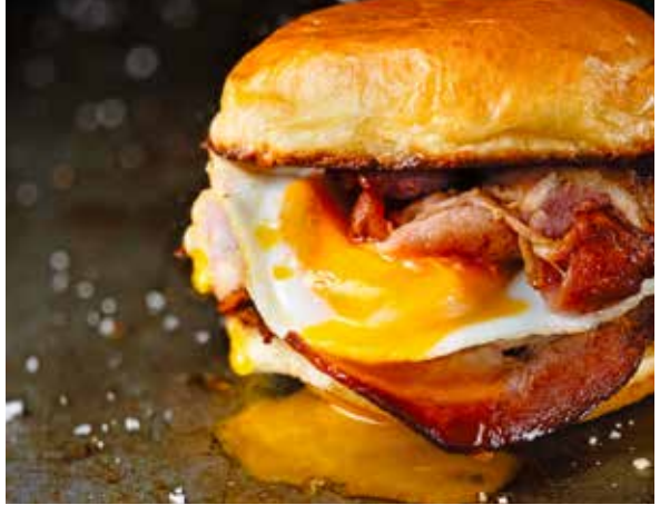
A1 UNSMOKED RINDLESS BACK BACON 2.27kg