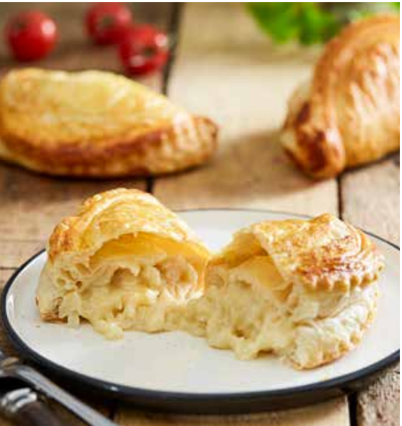
COUNTRY RANGE CHEESE & ONION PASTY 48 x 127g