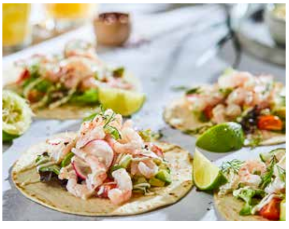
COUNTRY RANGE PRAWNS (150/250) BLUE BAG (25% GLAZE) 2kg