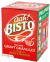
BISTO GRAVY GRANULES

1.8kg Original Poultry Reduced Salt Gluten Free Fine Vegan Vegetarian