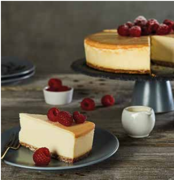
COUNTRY RANGE NEW YORK STYLE LARGE BAKED CHEESECAKE 1 x 14 Pre-portioned