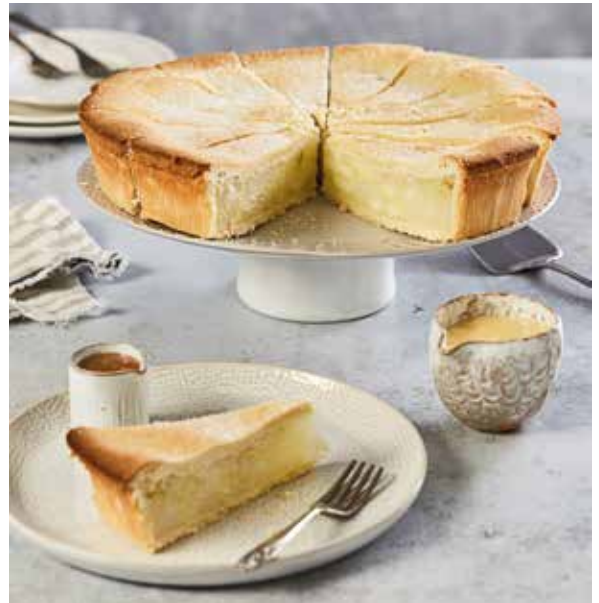
COUNTRY RANGE DEEP DISH BRAMLEY APPLE PIE 1 x 14 Pre-portioned