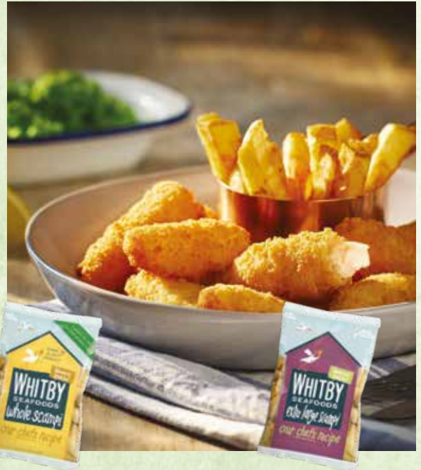
WHITBY SCAMPI 450g