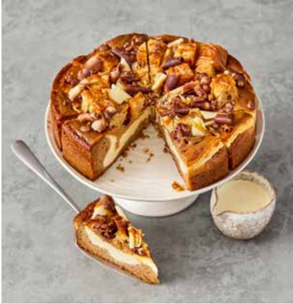
COUNTRY RANGE STICKY TOFFEE CHEESECAKE 1 x 14 Pre-portioned