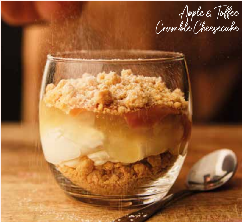
Apple & Toffee Crumble Cheesecake