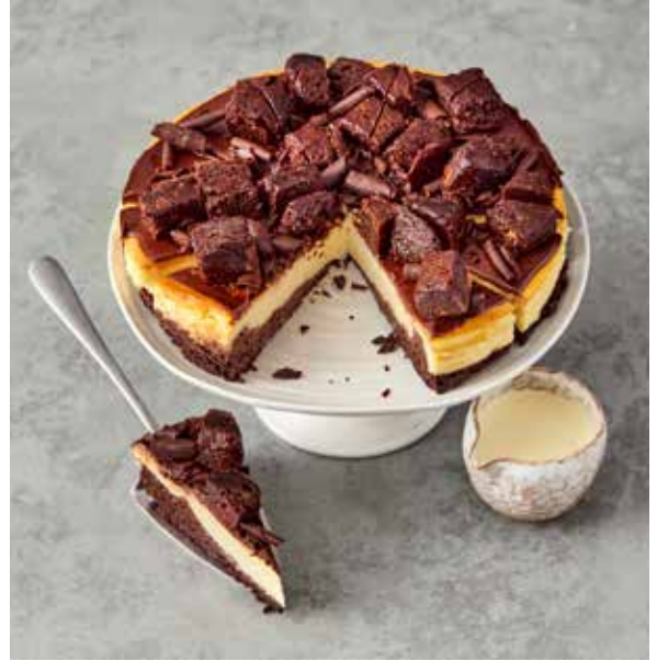
COUNTRY RANGE CHOCOLATE BROWNIE CHEESECAKE 1 x 14 Pre-portioned