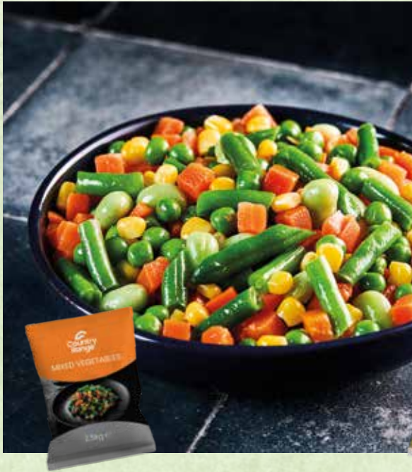
COUNTRY RANGE MIXED VEGETABLES 2.5kg