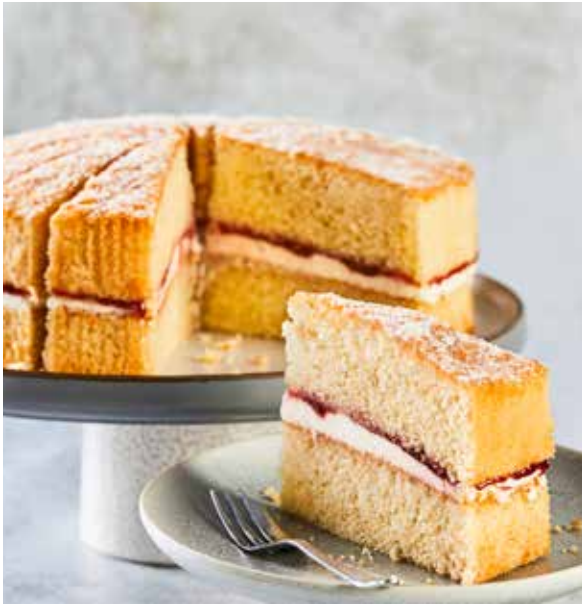
CATERING ESSENTIALS VICTORIA SPONGE CAKE 1 x 16 Pre-portioned