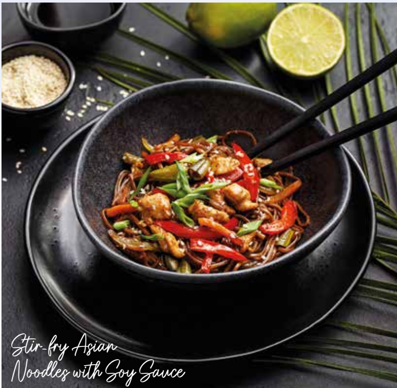
Stir-fry Asian Noodles with Soy Sauce