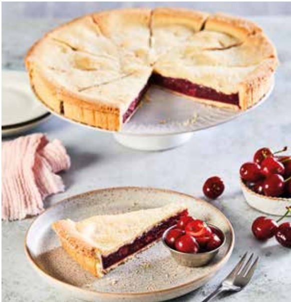
COUNTRY RANGE CHERRY PIE 1 x 12 Pre-portioned