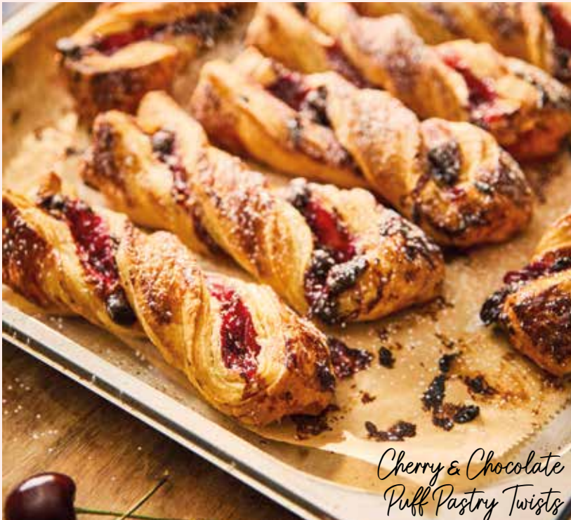
Cherry & Chocolate Puff Pastry Twists

Perfect for crumble desserts when paired with rich caramel, fresh cream & crumble