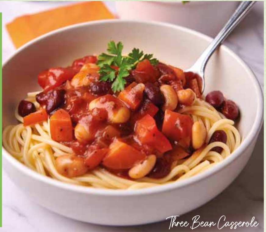
Three Bean Casserole