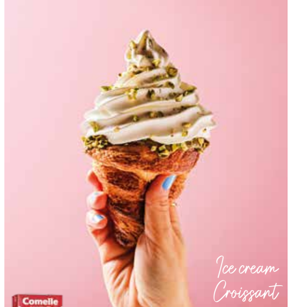
Ice cream Croissant